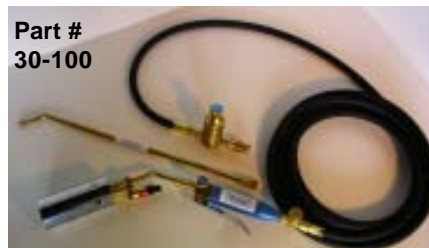
Part # 30-100