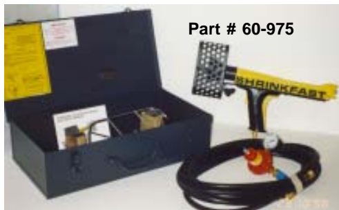
Part # 60-975