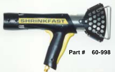
Part # 60-998